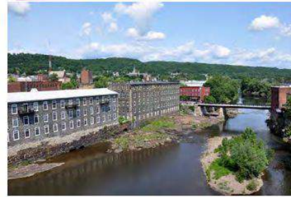
Canal Place in Little Falls, New York, an art class destination.