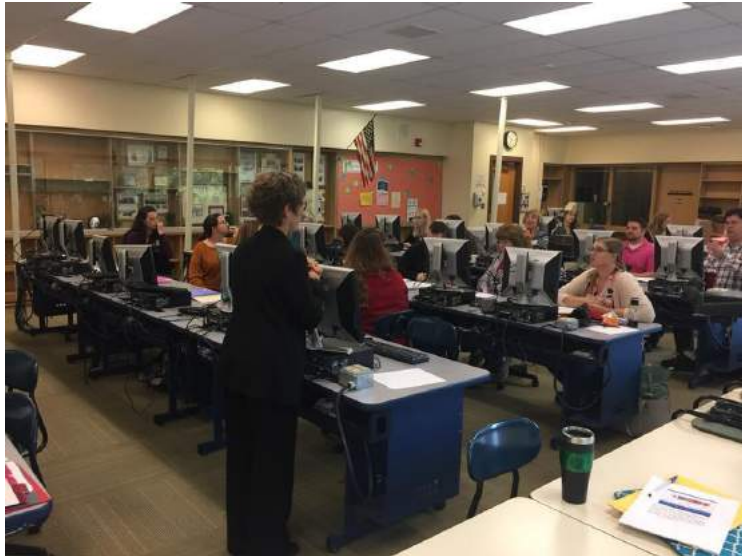
NYS Standards training for Herkimer County teachers