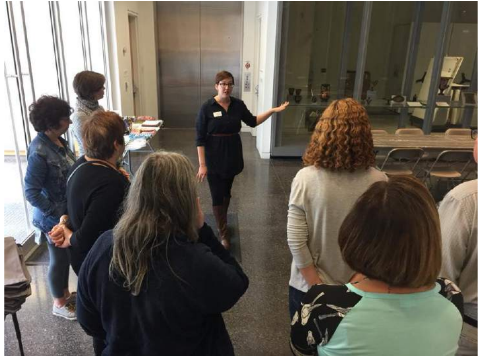
Two separate workshops for the NYSATA's 10 x 10 Members Exhibit: Herkimer County Art Circles 10 x 10 Challenge & Collaboration, Community, Creativity Workshop