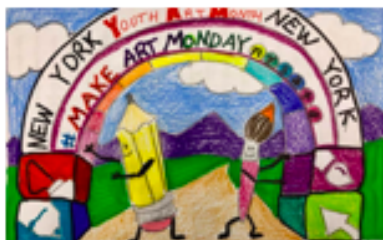
2018 Elementary Division Winner